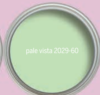
pale vista 2029-60

Dotted Tree Wall Art $54.99. 1. Drapery Panels $32.99 each. 2. Decorative Trim 5 1/2" Crown moulding (top) $1.87 per foot; 4 1/8" baseboard (middle) $0.72 per foot; 5 1/4" baseboard (bottom) $1.26 per foot. 3. Custom Bedding (as shown in photo) Duckoration pink/brown dotted fabric $15.98/metre, Duckoration pink/brown wave fabric $15.98/metre. 4. Custom Bedding (option for boy) Duckoration blue/brown dotted fabric $15.98/metre, Duckoration blue/brown wave fabric $15.98/metre. 5. Wool Rugs - size 3.6' x 5.6' - $159.99.