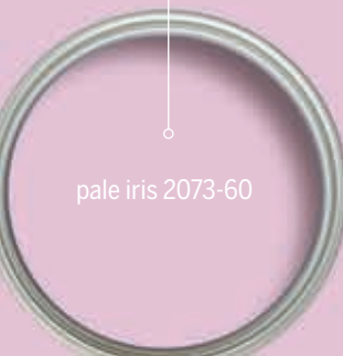
pale iris 2073-60