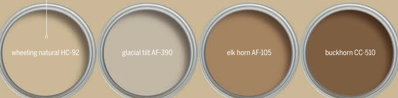
wheeling natural HC-92