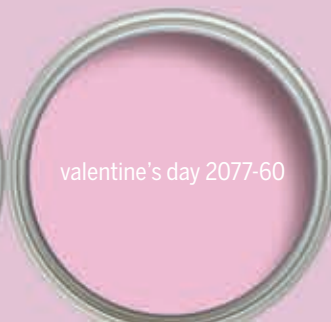
valentine's day 2077-60