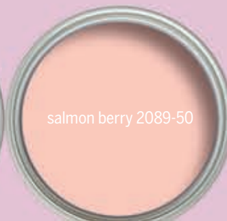
salmon berry 2089-50